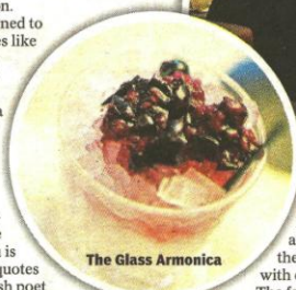
The Glass Armonica

Oscar Wilde, as a glorified Mike's Hard Lemonade. Both more ambitious and more delicious was the Hour Glass, adorned with egg white.